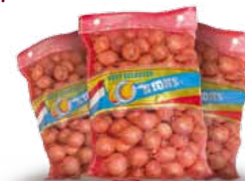
Mesh bags for onions