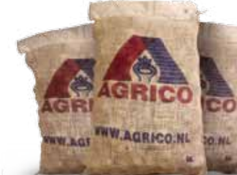
Gunnies for potatoes