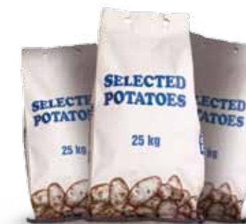
Paper bags for potatoes