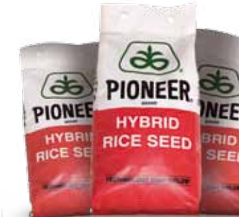
Woven polypropylene bags for bulk products